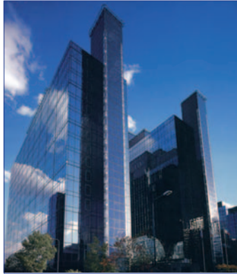
Harbour Exchange Square

The total value of equipment in the 100 Percent IT network exceeds £1½ million and we are expanding all the time.