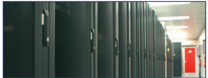
The Bunker, Newbury

Access to the buildings, data floors and individual areas is strictly controlled with multiple levels of security.